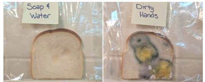
*Sandwich bread touched by hands washed with soap and water (left) *Sandwich bread touched with dirty hands (right)